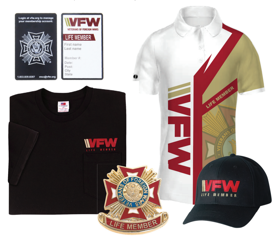
Shop at vfwstore.org for exclusive Life member merchandise. www.vfw.org

For more information, visit vfw.org/Join or call toll-free at 1.888.JOIN.VFW (1.888.564.6839).